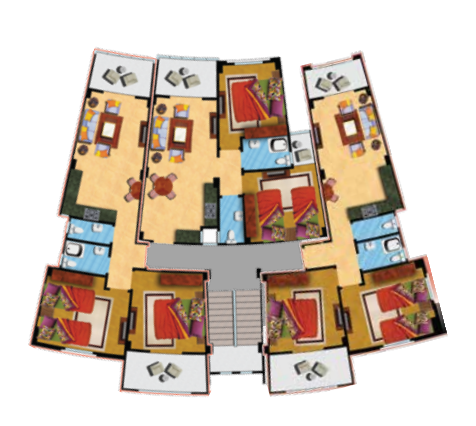
Type V 150 M<sup>2</sup>